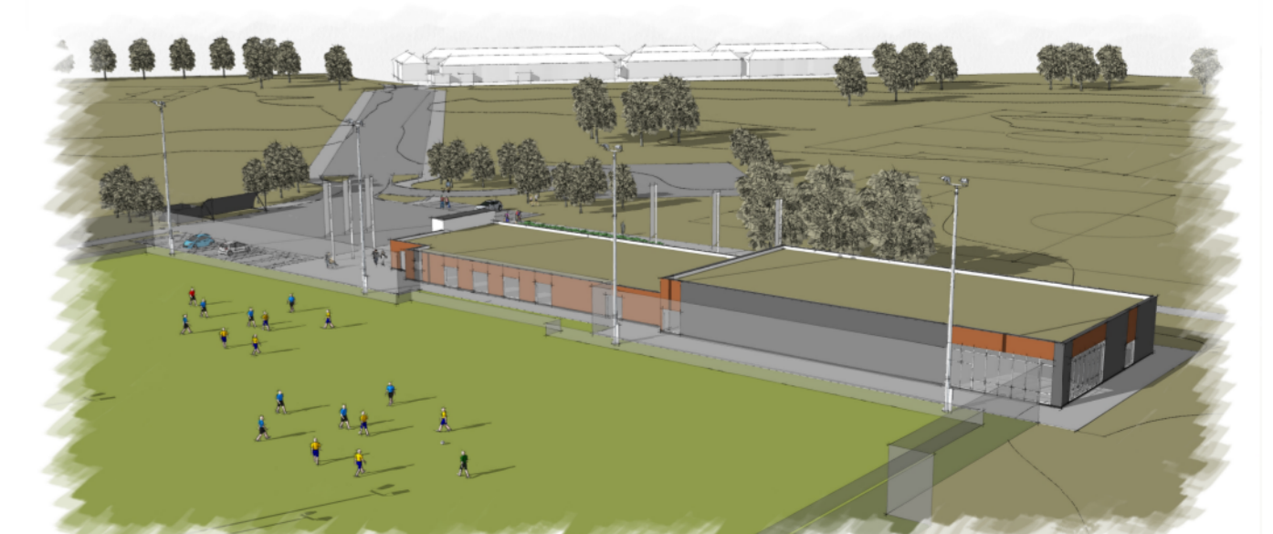
VIEW F - AERIAL VIEW FROM WEST