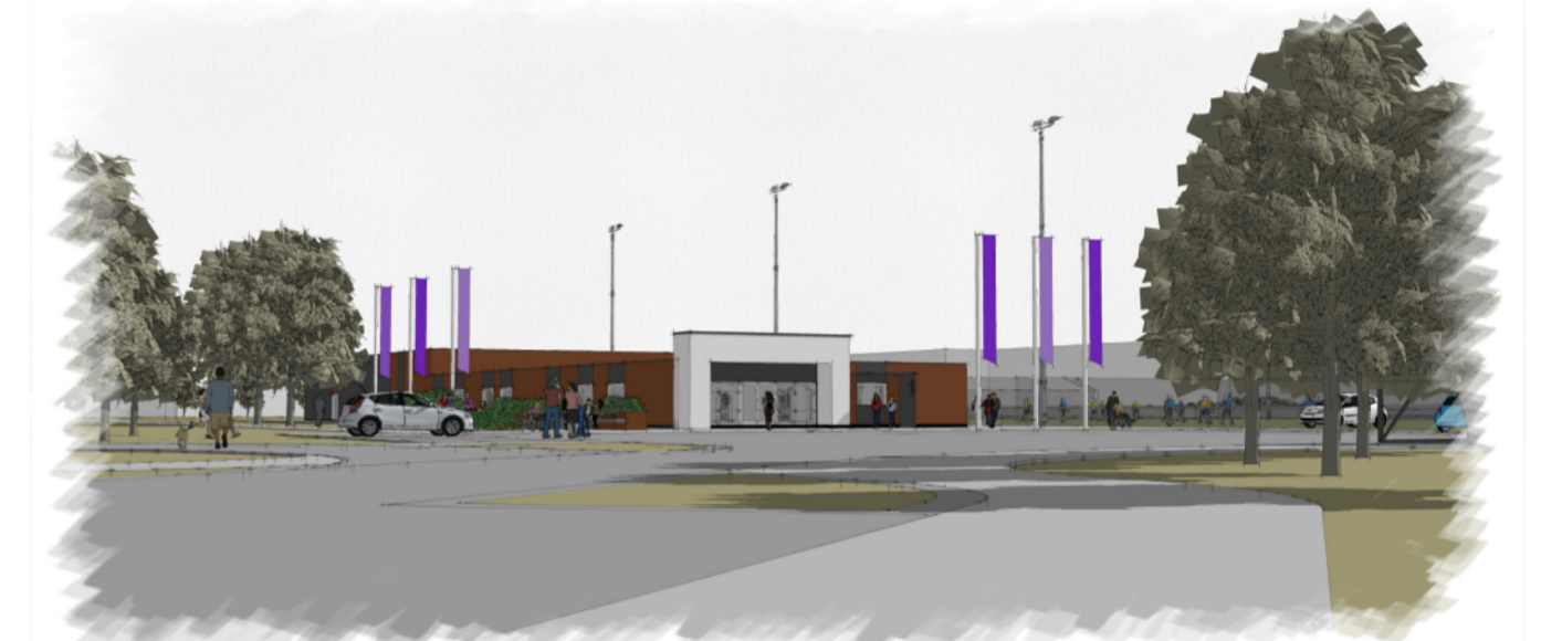
VIEW C - APPROACH TO BUILDING