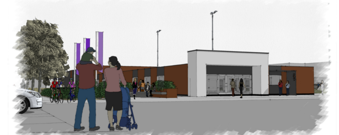
VIEW A - TOWARDS BUILDING ENTRANCE