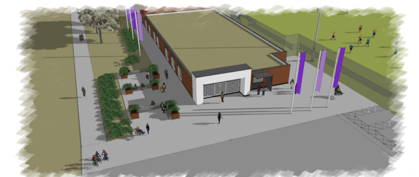
VIEW D - AERIAL VIEW FROM NORTH