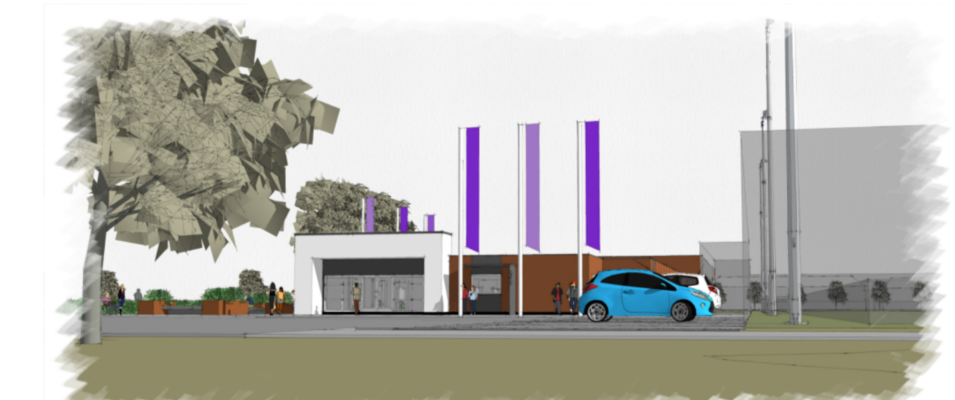
VIEW E - TOWARDS BUILDING AND PITCHES